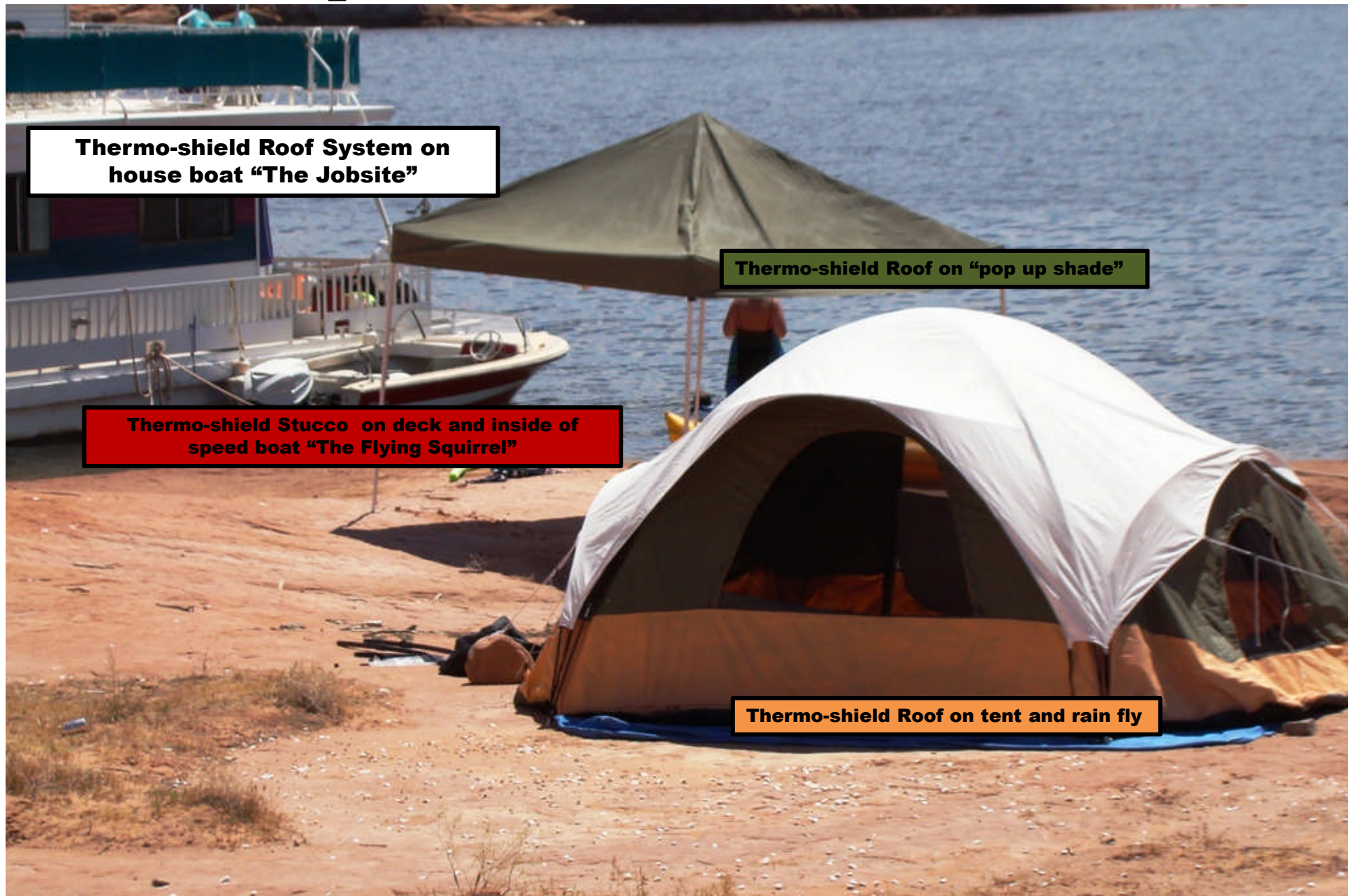
Thermo-shield Roof System on house boat "The Jobsite"